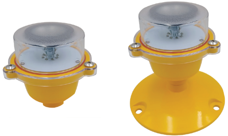
TX-LB-01 (L) type B