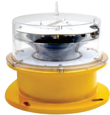
TX-MB-01 (L) type B